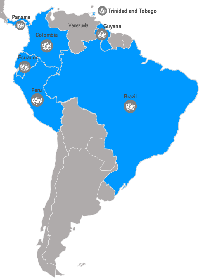
This map is stylized and not to scale. It does not reflect a position by UNICEF on the legal status of any country or area or the delimitation of any frontiers.

Map 1: UNICEF Country Offices with active response to the increased migration flows in LAC (September 2018)