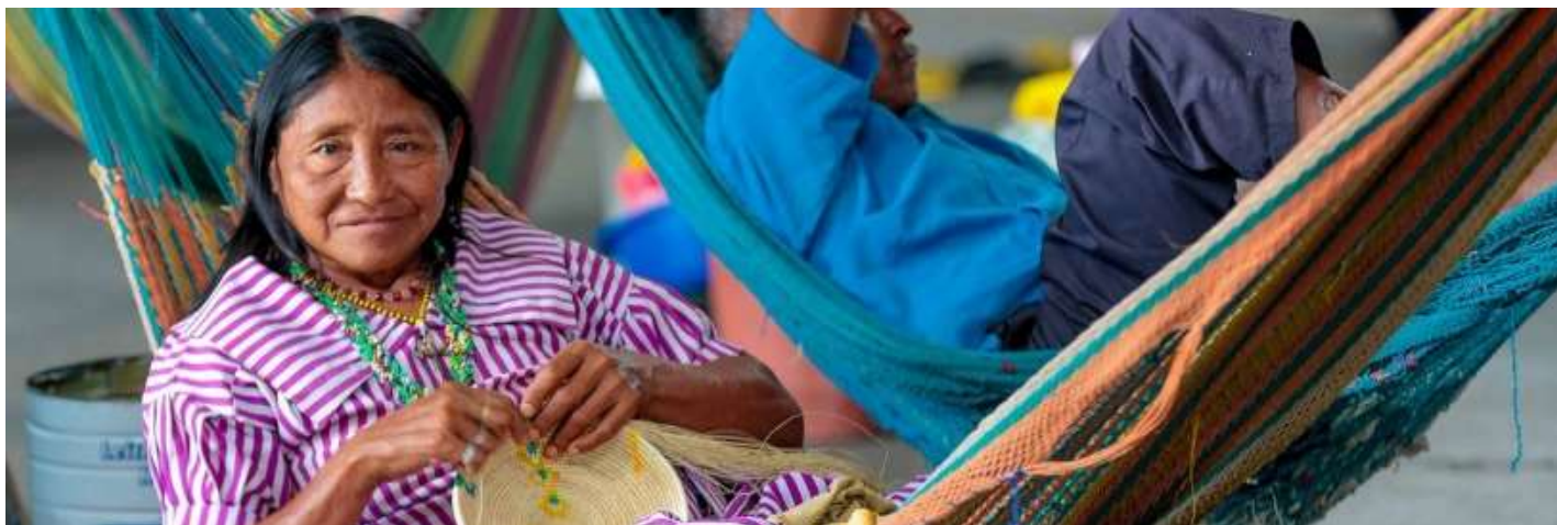
Indigenous Warao produce handicrafts at the Pintolândia shelter in Boa Vista.