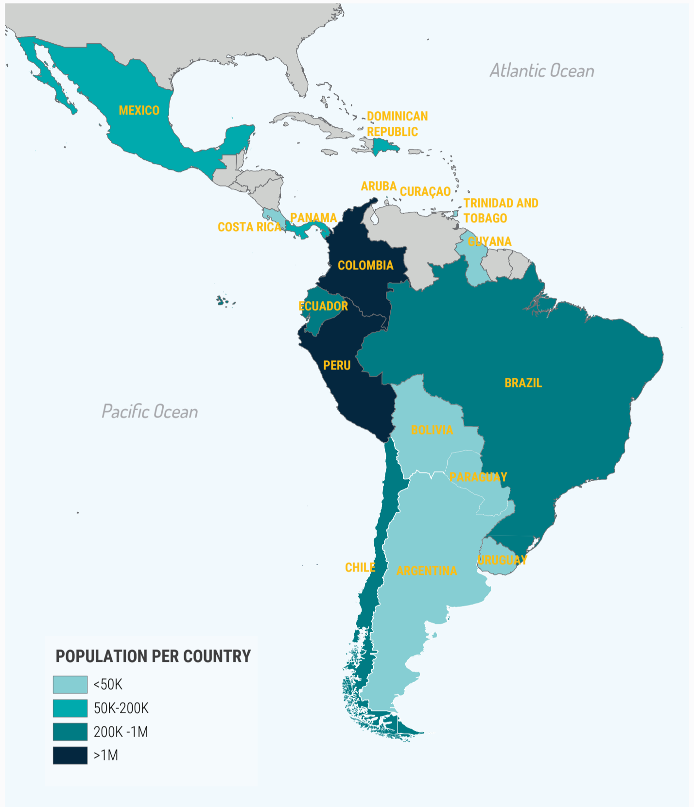
POPULATION PER COUNTRY