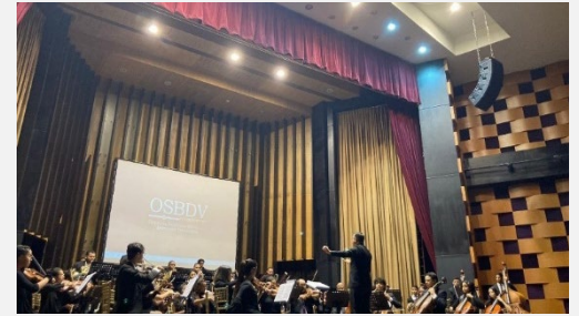
The third concert of the Orquesta Sinfónica Binacional Dominico-venezolana was held on 24 November, Al ritmo del agradecimiento in the framework of the Ciudades Incluyentes project.

R4V partners in Guyana and the Dominican Republic provided multipurpose cash and other electronic cash mechanisms to assist Venezuelans with temporary shelter accommodation, including survivors of GBV. To prevent eviction, partners in Curaçao also supported refugees and migrants from Venezuela with short-term individual shelter or temporary accommodation in the form of rent subsidies via bank transfers.