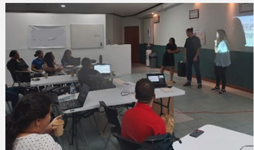
Training with Aruban R4V partners.