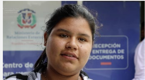
A video produced by R4V partners celebrated the first year of the Normalization Plan in the Dominican Republic.