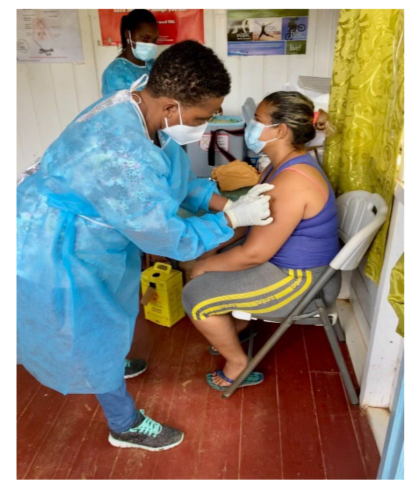
Vaccination campaign in Guyana

R4V partners promoted access to health services as a priority across all five sub-regional countries, reaching approximately 73% of the targeted population in 2021. They maintained successful telehealth initiatives in Aruba and Trinidad and Tobago, secured testing and treatment of persons with chronic, complex, and life-threatening diseases, and assisted pregnant and lactating women, through cash and voucher assistance. Mental health and psychosocial support (MHPSS) featured prominently as a priority area of intervention, with some countries focusing their services on survivors of gender-based violence, victims of trafficking and other 'at-risk' groups, whose access to healthcare is often compromised. Access to preventive and primary health assistance for refugees and migrants in vulnerable conditions, regardless of their status, was facilitated by R4V partners in Aruba and Curaçao, whereas in Trinidad and Tobago, the Dominican Republic and Guyana, these services were available publicly. Support to refugees and migrants living with HIV was also prioritized by partners, especially in Aruba where access to treatment was not available, and where partners advocated for inclusion of this population in public HIV treatment plans. Services included general check-ups, health screening fairs, and MHPSS assistance in Spanish which narrowed language barriers. In some Caribbean countries, partners purchased medicines and other supplies, including