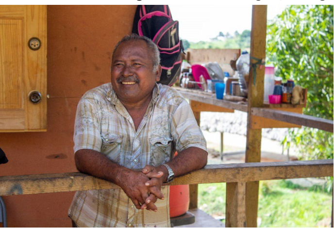
Community-based protection activities delivered to indigenous refugees and migrants in T&T

MHPSS and direct assistance such as food, non-food items, vocational trainings, provision of emergency shelter, cash and voucher assistance, and support regarding access to justice. Partners in Aruba coordinated with the task force on solutions and on case management for Victims of Trafficking (VoTs), while partners in Trinidad and Tobago delivered TiPrelated capacity-building for key stakeholders. In Curaçao, partners in collaboration with the authorities provided extensive training to frontline workers on the identification, referral of and assistance to VoTs. For more information on this topic, refer to <u>Trafficking</u> <u>in Persons Background Notes</u>.