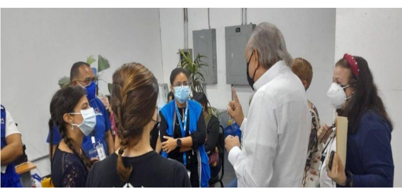
R4V team visits the Normalization Plan information windows in the DR

however, access for Venezuelans remained uncertain due to stringent requirements. Finally, in Trinidad and Tobago, in the beginning of 2021, Venezuelans registered in a June 2019 exercise were called to re-register and received extensions on their stay permits through the end of the year. Further details on all programmes and achievements for the Integration Sector available in Integration are the Background Notes.