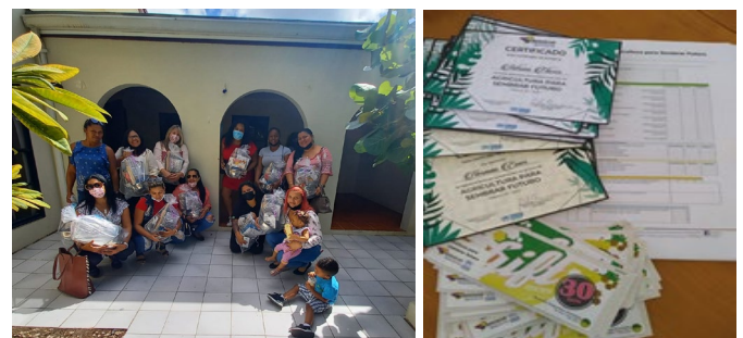
Graduates of the bakery course with their kit