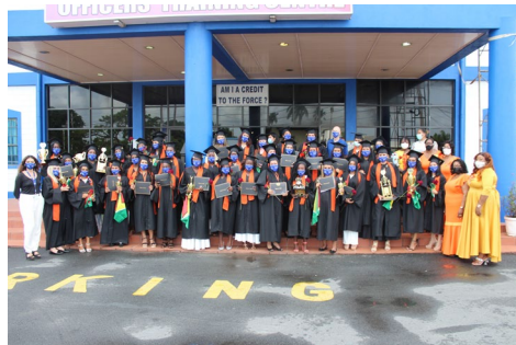
Cosmetology course graduation day. The project ran for three months, between March and June 2021.

One R4V partner implemented a socio-economic support program where at-risk families accessed basic services and support networks to integrate them in the host country while meeting survival-level needs through cash-based interventions . Furthermore, R&Ms participated in the “Cloth Mask Programme”, through which an R4V partner provided technical training and the required supplies to produce cloth masks, later bought back by the partner and distributed to vulnerable communities.