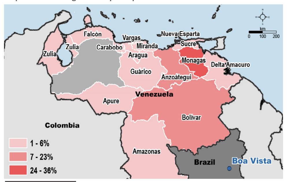
Map 2. Areas of origin of FGD participants

In August, areas of origin of Venezuelan FGD participants remained similar to those of participants assessed in July. The majority were from the Northeast region (58%, primarily Monagas and Anzoátegui states), followed by Bolivar state in the south (33%) that shares a border with Roraima state (Brazil).