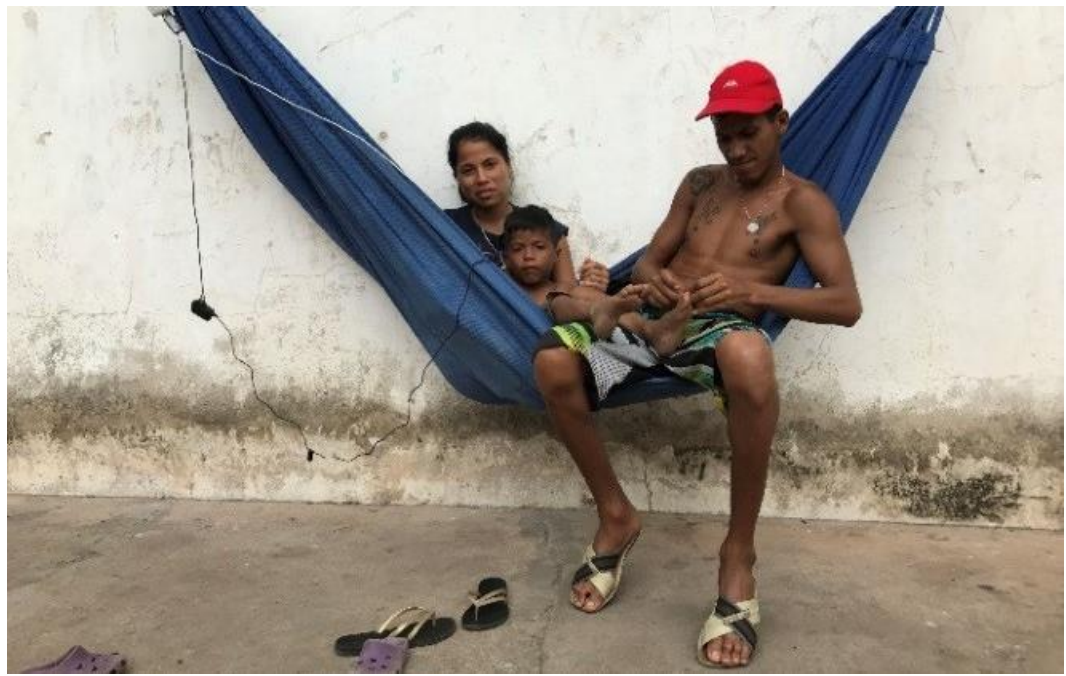
After arriving in Boa Vista, Brazil, with only the things they could carry, this young family found refuge in the Tancredo Neves shelter. As there is no more space inside the shelter, they sleep together in a hammock they brought with them. Some 400 Venezuelans are currently living in the shelter set up in Boa Vista, even though the maximum capacity is for some 300 people.

UNHCR is working with Governments to address the protection and essential needs of Venezuelans in host countries and continues to call for protection-oriented responses, such as humanitarian visas, special stay arrangements or other regional migratory frameworks, with the relevant protection safeguards. UNHCR has developed a regional response plan that covers eight countries and the Caribbean sub-region.