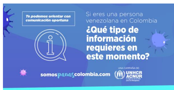
Somos Panas Colombia continues to disseminate key orientation messages through social media in order to reach out Venezuelan refugees and migrants during the quarantine.

Adding to specific activities developed at local level, in the framework of the anti-xenophobia campaign Somos Panas Colombia UNHCR continues to reinforce messages of solidarity and provide information related to health services and other concerns raised by Venezuelan refugees and migrants and host communities during the mandatory isolation period.