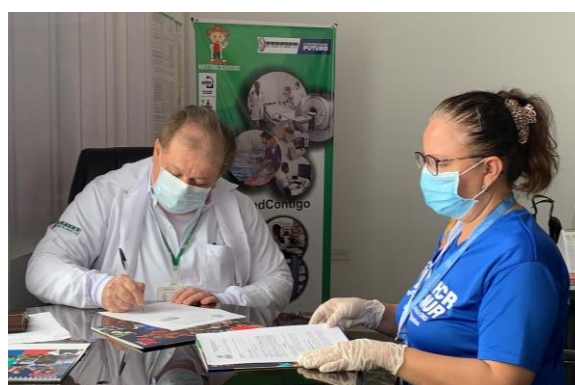
In Arauca, UNHCR staff and partners are working with authorities and medical staff to support local capacities in the humanitarian response.

isolation measures, vulnerable Venezuelans including those already living in Colombia, those in transit and the pendular migrants holding Border Mobility Cards, are no longer able to obtain food, medicine or cash in Colombia to support themselves and their families in Venezuela. Given the situation, many Venezuelans continue returning to Venezuela through irregular border crossings, due to the growing lack of food and restrictions on access to health and livelihoods in Colombia.