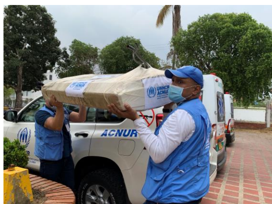
On 3 April, UNHCR staff shift three air conditioning units donated to the San Vicente Hospital in Arauca, contributing to reinforce local capacities in face of the COVID-19 emergency.

During the last two weeks, UNHCR continued reinforcing and complementing local institutional capacities responding to the COVID-19 situation. In Arauca , three air conditioning units were donated to the San Vicente Hospital.