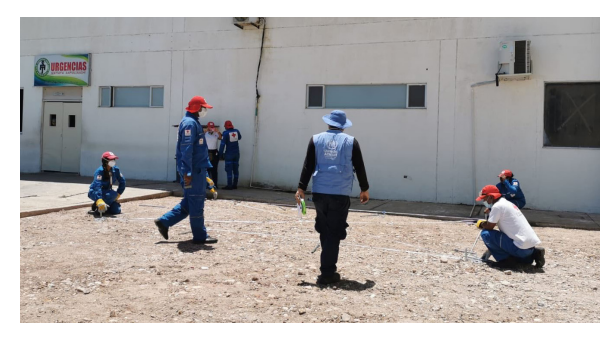
At the San José de Maicao Hospital and the CAI in La Guajira, UNHCR continues to provide RHUs.

In Barranquilla, arrangements in the temporary shelter in Malambo supported by UNHCR have been adjusted to a maximum capacity of 24 people, with an isolation area, to allow the shelter to remain open in accordance with Government standards.