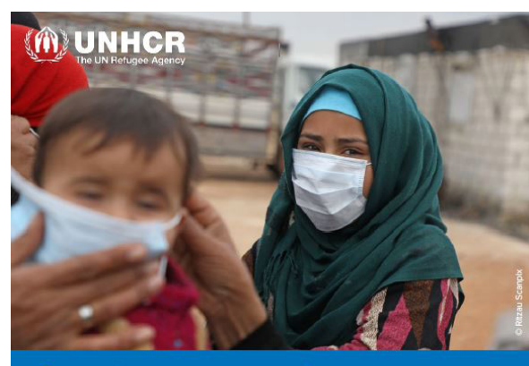
Coronavirus emergency appeal UNHCR's preparedness and response plan (REVISED)

Scale-up of multipurpose cash assistance to address emergency shelter and basic needs of individuals at heightened risk (at least 2,000 cases), involving Venezuelans and vulnerable host communities.