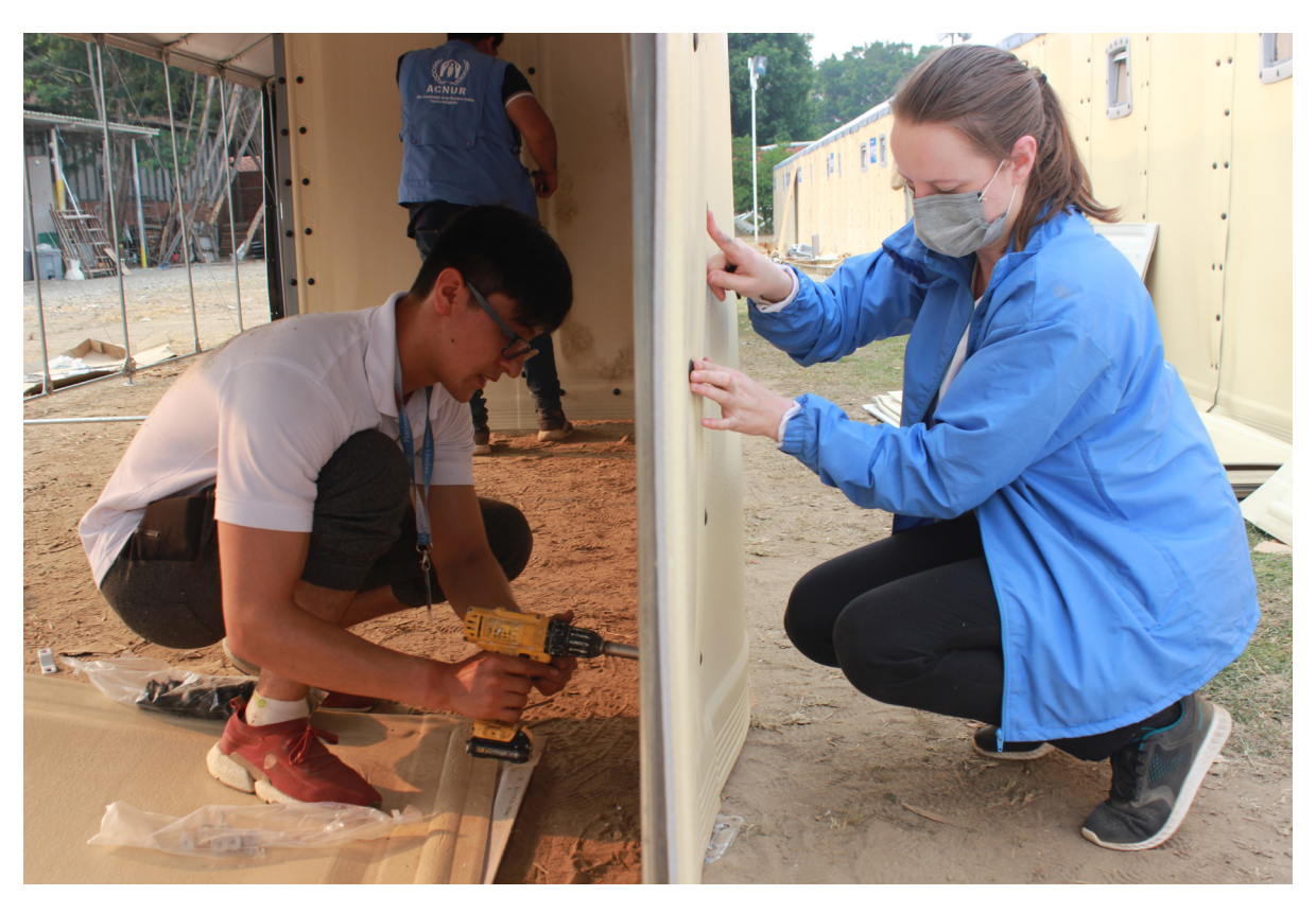
UNHCR staff help set up 30 Refugee Housing Units (RHUs) at the Erasmo Meoz Public Hospital in Cucuta to serve as care areas for COVID-19 positive patients.