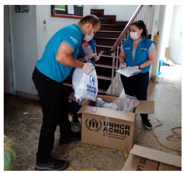
In Medellin, UNHCR staff unpack baby kits which will be distributed to Venezuelan refugees and migrants via its local partner, Famicove.

UNHCR Arauca together with WFP and local authorities has identified 5,000 vulnerable people in the department for food kit distribution to be conducted this week. UNHCR Barranquilla is providing food supplies to 47 Venezuelans hosted in a hostel during the quarantine, including children, pregnant women and one adult with disabilities.