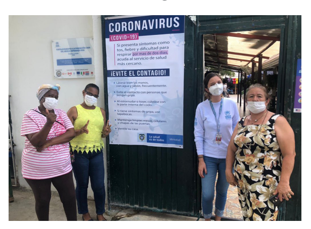
In Riohacha, UNHCR is working with the Mayor's Office, the Governor's Office and humanitarian partners to strengthen prevention and response measures at the Casa del Abuelo Foundation, where older adults and vulnerable Venezuelan population are housed.

UNHCR continues to support the local, regional and national authorities in their response to COVID-19 in close collaboration and coordination with PAHO (Pan American Health Organization) and other humanitarian organizations.