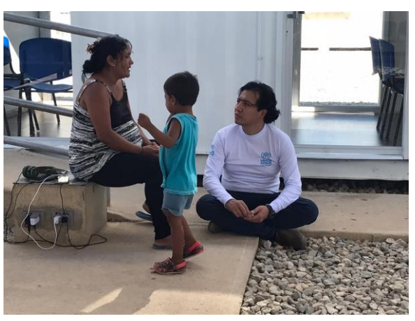
UNHCR staff discussing with a pregnant Venezuelan woman in La Guajira about her needs.

The Departmental Health Institute (IDS) in Cucuta inspected the Safe Spaces for pregnant and lactating women and survivors of gender-based violence run by UNHCR and found they complied with the COVID-19 health and sanitary recommendations. As such the centers, hosting fewer than 50 individuals, can continue functioning.