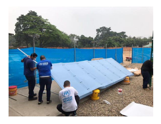
UNHCR supports the health response to COVID-19 at the border with Venezuela and Colombia by installing Refugee Housing Units that will serve as observation and isolation spaces at the hospital.