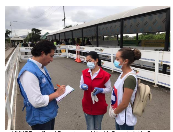
UNHCR staff and Departmental Health Secretariat in Cucuta discussing the humanitarian corridor for Venezuelan refugees and migrants with critical health cases.

Border crossings with Venezuela have been closed since 05:00 am on 14 March, and there is limited access to territory for persons in need of international protection. Authorities are maintaining open a humanitarian corridor for critical health cases at the three international bridges in Norte de Santander (see details below).