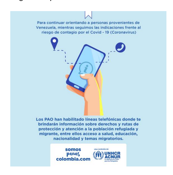
Through the Somos Panas campaign, UNHCR informs beneficiaries about its telephone call centers, providing phone numbers for up-to-date information throughout Colombia.

To ensure continued operation of its Information and Orientation Centers (PAOs), UNHCR activated call centers in 24 locations nationwide (detailed contact information available here: https://www.instagram.com/p/B97s8AiBd7X/) to provide orientation on prevention measures and where to call/go in case of suspected COVID-19 cases, identify cases needing urgent assistance, SGVB prevention and response measures during mandatory isolation period, rights, regularization procedures and access to services. Cases are recorded in PRIMES, UNHCR's registration, identity management and case management system.