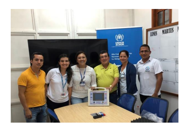
UNHCR Putumayo donated a mechanical ventilator for resuscitation to the Mocoa Hospital to support the health response to Colombian and refugee & migrant populations from Venezuela