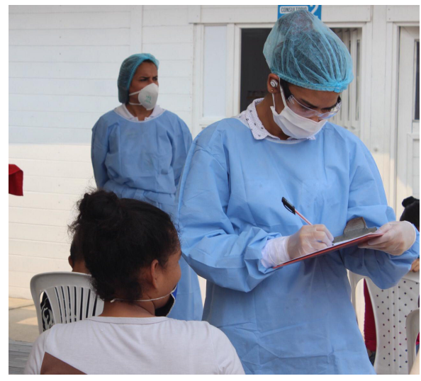
The UNHCR-supported Las Margaritas primary health care facility in Villa de Rosario, Norte de Santander.

In the framework of the anti-xenophobia campaign Somos Panas Colombia - Valientes , and in partnership with UN Women, a total of 10,302 people were reached through social media with information for women and girls facing sexual and gender-based violence in Atlántico and Arauca.