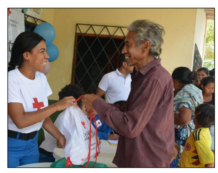
Photo 2: Distribution of hygiene kits in La Guajira.

In light of the continuing humanitarian need, this Revised Emergency Appeal has set itself the goal of providing 170,000 health and complementary services, including shelter, livelihoods, hygiene and protection services, to vulnerable people in need, over an extended period of 27 months. Special attention will continue to be given to pregnant women, children and breastfeeding women. In order to reach this population, this Emergency Appeal has focused on i) border cities that report the largest migration flows: Riohacha (La Guajira), Arauca (Arauca) and Ipiales (Nariño), and ii) cities affected by migration flows and with little or no humanitarian assistance available: Puerto Carreño (Vichada) and La Hormiga (Putumayo). On the other hand, services are also being provided in some of the biggest cities in Colombia where migrants have been