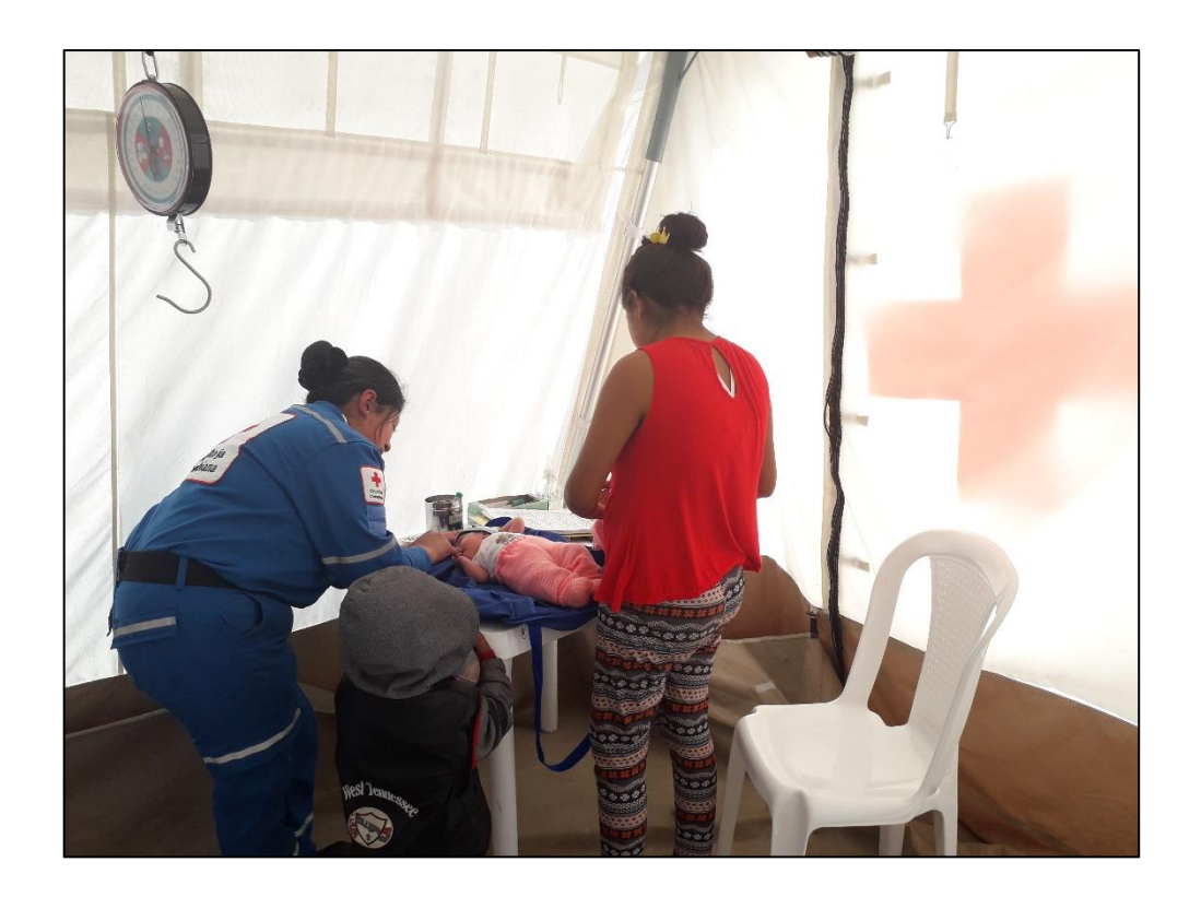
Photo 3: A young mother and her seven-day old baby receiving post-natal care in the CRCS Health Care Unit in Ipiales, Nariño.