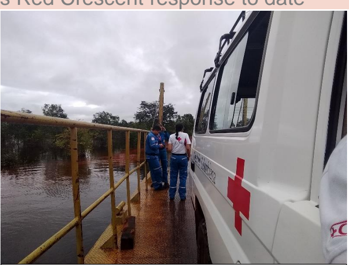
Photo 1: CRCS teams in Vichada travel downriver to the town of Casuarito to provide essential medical services to vulnerable migrants. Source: IFRC, April 2019.

February 2018 : The Colombian government expresses its willingness to receive international support, with the