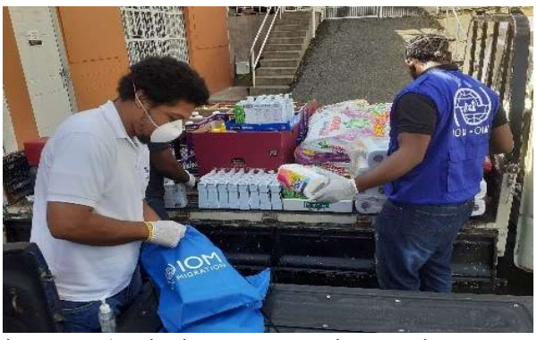
three rotating hotlines were implemented to assist and