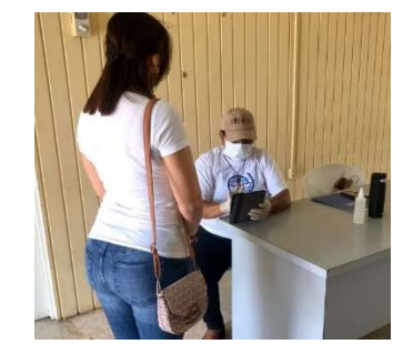
Figure 1: Food distribution by R4V partners on 28 March Willemstad, Curação