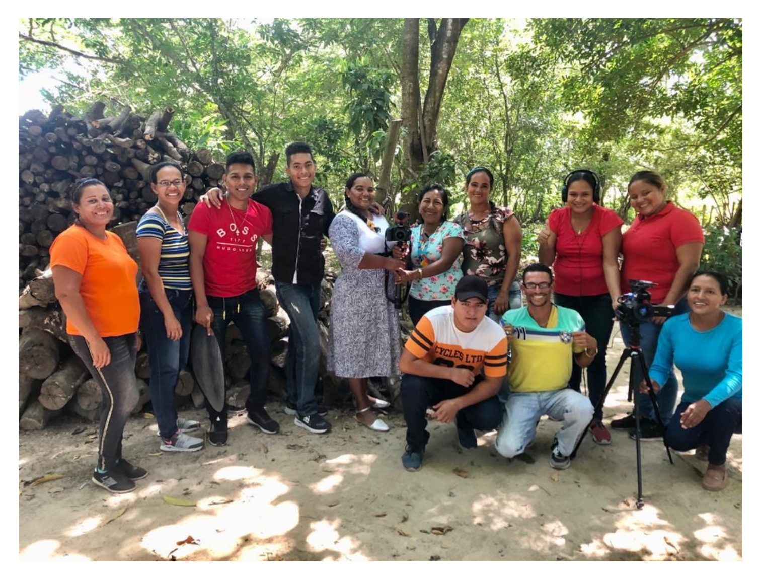
Figure 2. Participatory Video, El Refugio, Arauca, 9-13 December, 2019

Life Stories of Cash Recipients. Communities' Voices on Cash video interviews consists of collection of short communities' testimonials related to different aspects and thematic of Cash and Vouchers, produced by the project facilitators (Meaningful Dialogue with Communities) in collaboration with the participating communities' members. These video-interviews was conducted in the form of story-telling or semi-structured interviews with different community profiles such as people on the move/ caminantes, elders and people with disabilities. This activity was possible thanks to the the collaboration of Action Against Hunger, Humanity and Inclusion, Save the Children and Colombian Red Cross. We have a dialogue about information needs, rumours, needs, feedback and recommendations for the humanitarian community. The content generated quality voices presented as a short video product of 15 minutes of feedback and recommendations shared at the Regional CBI platform with CWG leads and the CWG Colombia.