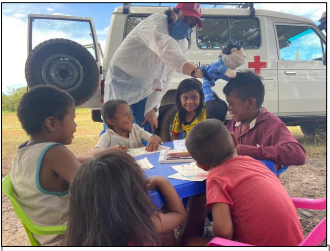
CRCS psychologist attending to migrants through the friendly space in Vichada, June 2020.