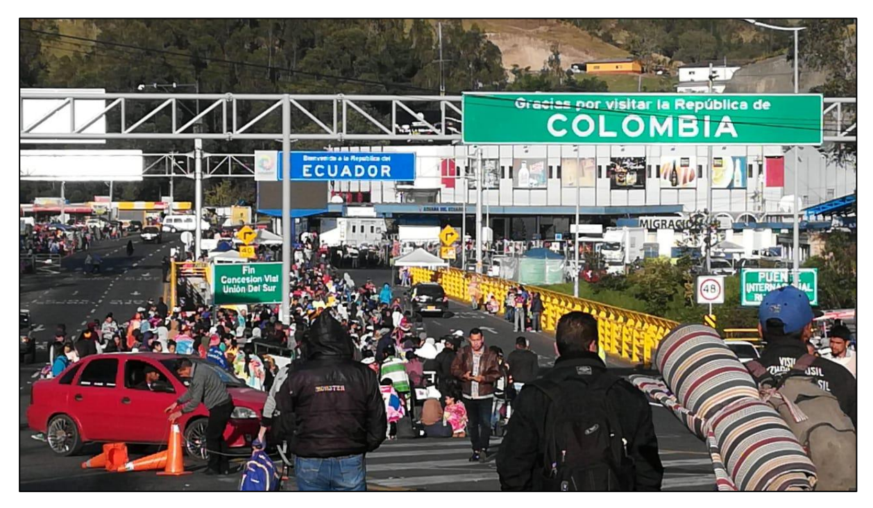
Photo 2: The Rumichaca border crossing on the morning of 25 August 2019.

Migracion Colombia reports that on the weekend of 24 and 25 August, more than 11,000 Venezuelan citizens were able to complete the migratory process to leave Colombian territory through the Rumichaca border. In the morning of 27 August, a significant decrease in the flow of migrants between the north-eastern border of Colombia and Venezuela (Norte de Santander) was noted. From Ipiales, it is reported that there are very few persons crossing the border, and police presence is noted. As of the afternoon of 28 August, approximately 800 persons, including families with children, were reported around the border at Rumichaca, unable to cross.