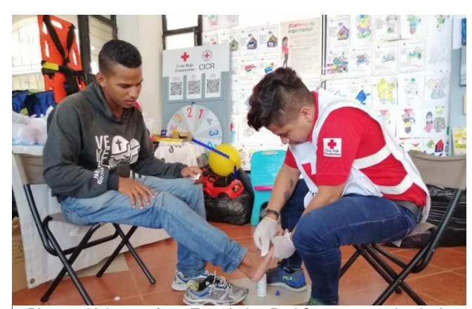
Photo 1: Volunteer from Ecuadorian Red Cross supporting in the Sucumbios Border Centre.

According to the new measures announced by the Government, as of from 26 August 2019, all Venezuelan citizens will need a humanitarian visa to Enter Ecuador. Because of these new regulations, the flow of people entering Ecuador has increased considerably over the past days (according to Migracion Colombia, the Colombian national migration authority, this increased by 30 percent compared to previous weeks) and reached peaks of 3,000 people entering daily in Ecuador. The measure is based on