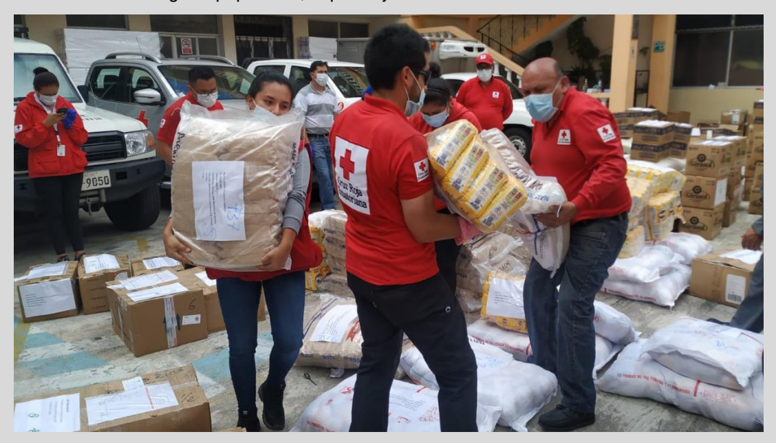
Quito Headquarters, distribution of humanitarian aid and PPE for the provincial boards. April 2020.