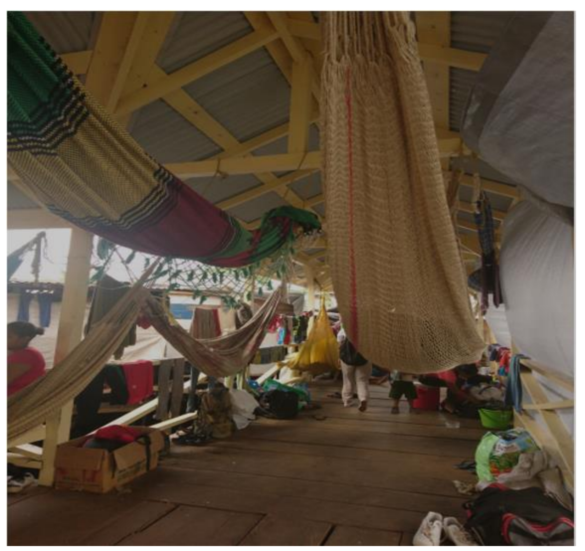
Temporary shelter at the dock in Mabaruma, Region 1