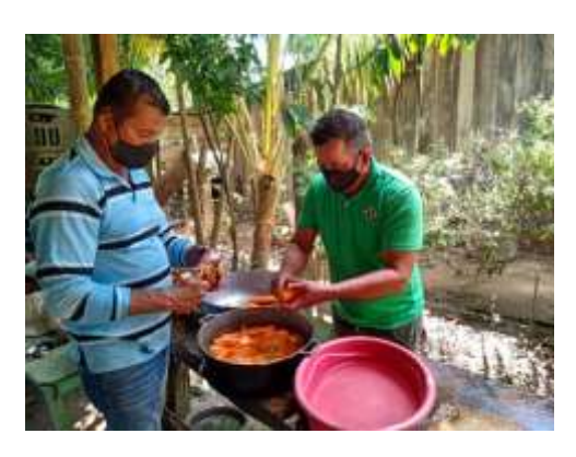
Workshop on food and nutrition education for refugees and migrants in Bocas de Juju, Arauca.