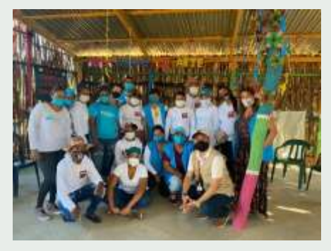
Delivery of food supplies in La Guajira.

In order to provide greater attention to refugees and migrants from Venezuela, War Child and its program "Safer Together!" (¡Juntos más seguros! in Spanish) opened three protection spaces in the Airport settlement ubicated in the municipality of Uribia, in the department of La Guajira. However, War Child allied with SOS Children's Villages, also present in this settlement with two protective and educational spaces, to reach and assist more population by integrating efforts and providing comprehensive care to everyone.