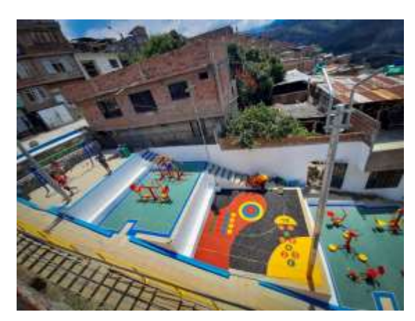
Improvement of community structures for refugees and migrants in Cali, Valle del Cauca.

UNCHR | UNHCR/HIAS | UNHCR (APOYAR - APS - CISP Comfenalco - CORPRODINCO - Corporación Scalabrini Diócesis de Tibú - DRC - FAMIG - Opción Legal - Pastoral Social - JRS Col - SNCRC) | SOS Children's Villages | Bethany | CAPELLANIA OFICA | CISP | Caritas Germany (Pastoral Social) | Caritas Switzerland (FAMIG) | HIAS | Malteser International (ABIUDEA) | NRC | IOM | IOM/ Action Against Hunger, UNHCR, APOYAR, De Pana Que