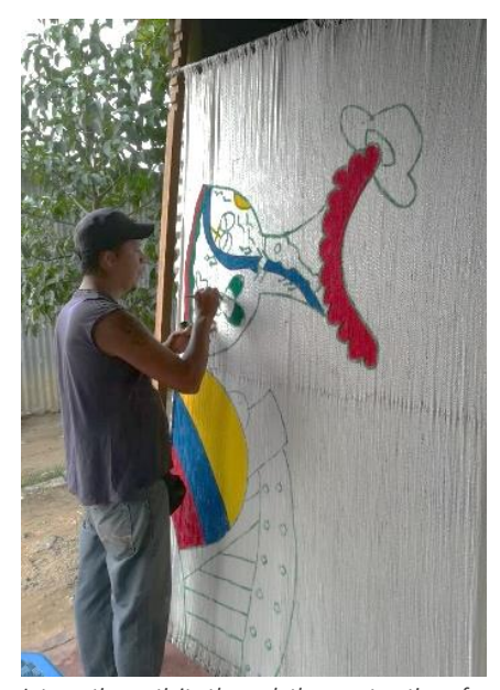
Integration activity through the construction of a "chinchorro" (hammock) in the municipality of Arauca where refugees, migrants and members of the host community participated, in compliance with all biosecurity measures.

In May, more than 10,200 beneficiaries received one or more types of assistance through 18 RMRP direct and implementing partners, in 17 municipalities of 12 departments, in border and transit areas, as well as areas where refugees and migrants have an intention to stay. During the month, surveys were carried out to monitor the situation and the impact on productive units, both in La Guajira, within the framework of the Socioeconomic Integration taskforce, and in Norte de Santander, as inputs to prepare proposals for fundraising. Another priority of the sector was the articulation of the actions of partners with the design of the Development Plan, particularly in Norte de Santander.