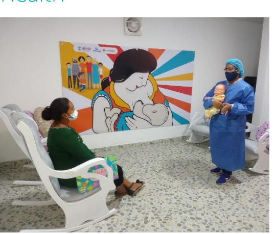
The "Breastfeeding Corner" space of the Sexual and Reproductive Health Unit provides health care for Venezuelan and Colombian pregnant and lactating women in Maicao, La Guajira.