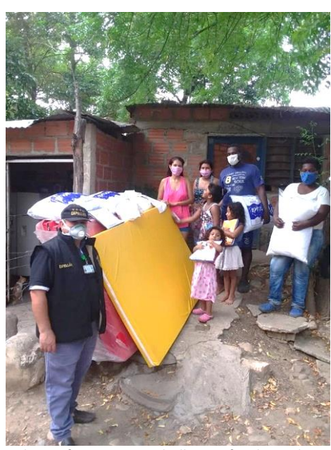
Delivery of mattresses and pillows to families in the El Escobal sector, in Norte de Santander.

In May, more than 21,000 beneficiaries received one or more types of support through 20 RMRP direct and implementing partners, in 34 municipalities of 17 departments, in border and transit areas, as well as areas where refugees and migrants have an intention to stay. The Multisector subgroup has focused its response to accompany and monitor the occupation, expansion and diversification of temporary and transitional shelters. During the month, the distribution of household items continued in a small scale, according to the COVID-19 preventive measures. Humanitarian transport remained suspended. The subgroup led, together with the Protection sector, the construction of tools for monitoring and responding to situations of forced evictions.