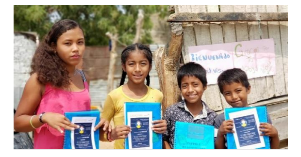
With the support of the Education Cannot Wait fund, study materials were delivered to the homes of children of the Wayúu communities and Venezuelan migrants, in Maicao and Riohacha.