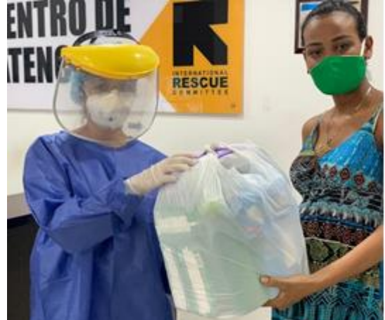
Distribution of maternity kits to the refugee and migrant population, in the Centro Comprensivo Comunitario (CCC) in Cúcuta, Norte de Santander.

Action Against Hunger | Bethany | CAPELLANIA OFICA | CISP (INTERSOS) | Caritas Germany (JRS Col - Pastoral Social) | Caritas Switzerland (FAMIG - Pastoral Social) | Colombian National Red Cross Society | DRC | Diakonie (CID - Fundación Tierra de Paz) | GIZ/Corporación Scalabrini | IRC | NRC | OXFAM (Fundación Mujer y Futuro) | PADF | Plan International | UNDP | UN Women | UNHCR (Bethany - CID - CORPRODINCO - COSPAS - Corporación Ayuda Humanitaria - Corporación Scalabrini - DRC - HIAS - Opción Legal -Pastoral Social - Colombian National Red Cross Society) /Defensoría/IOM | UNICEF (SOS Children's villages - Ayuda en Acción -ESE HOSPITAL SAN JOSE DE MAICAO - PROINCO – Significarte -Colombian National Red Cross Society - Universidad Santo Tomás) | World Vision