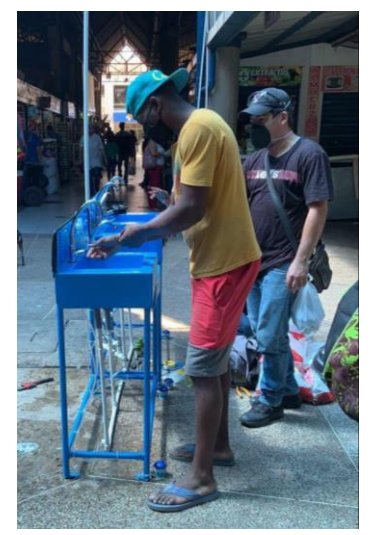
In light of the large concentration of people in the Cenabastos market square in Cúcuta (Norte de Santander). Action Against Hunger installed five portable sinks with access to soap at different points in the square.