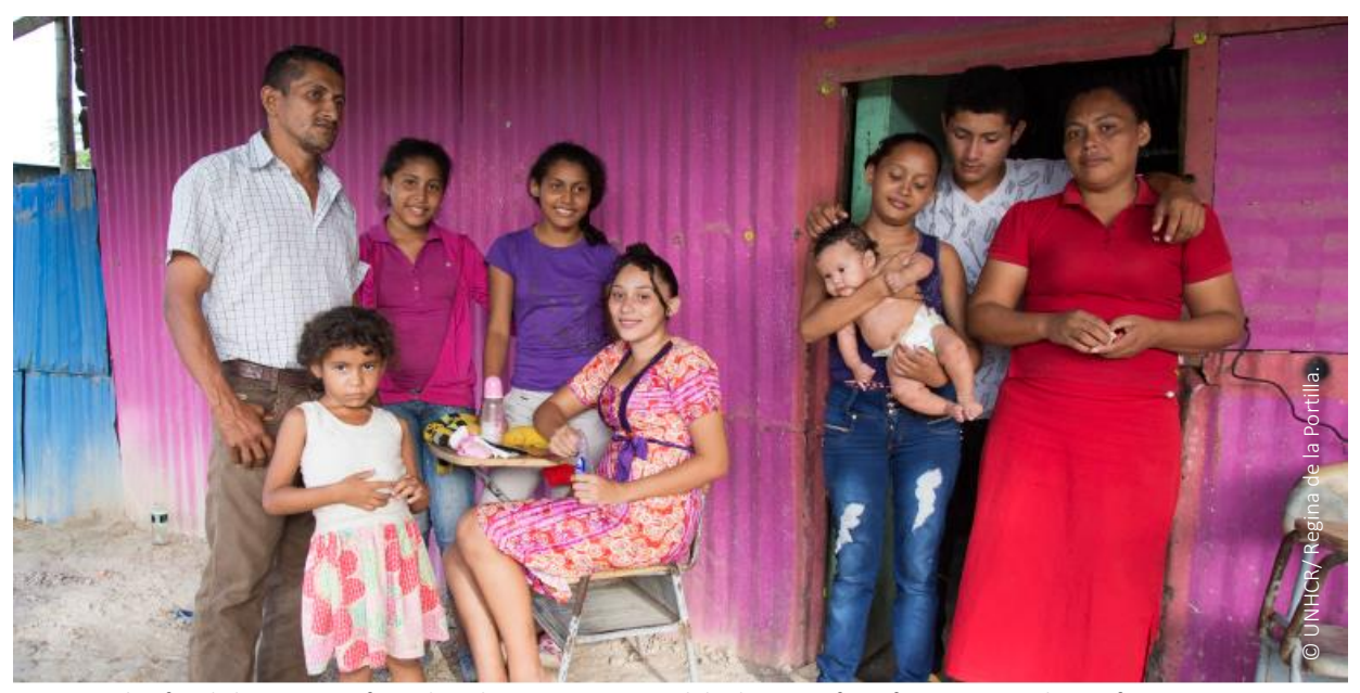
A Venezuelan family lives in an informal settlement in Arauca while they wait for information on their refugee status.

The Interagency Group for Mixed Migration Flows (GIFMM in its Spanish acronym) was created at the end of 2016 by the International Organisation for Migration (IOM) and the United Nations High Commissioner for Refugees (UNHCR) to respond to the increasing flow of people arriving from Venezuela. The group coordinates the national response to the situation of refugees and migrants in Colombia. It currently has 46 members.