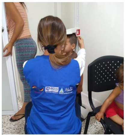
Measuring a child in Villa del Rosario, February 2019