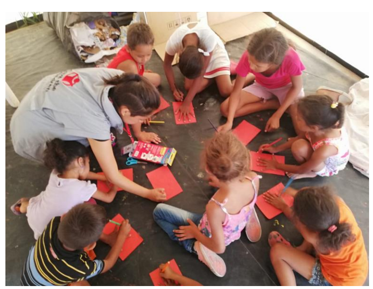
Recreational activities and psychosocial support for migrant children in Child Friendly Spaces, Arauca.

In La Guajira more than 4,700 children received psychosocial attention, including a number of children who have arrived in Colombia with aggressive behaviour and demotivation due to the breakdown of family ties.