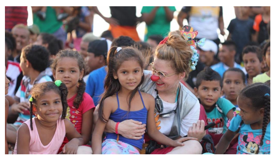
Clowns without Borders bring smiles and happiness to children in Riohacha, Guajira.