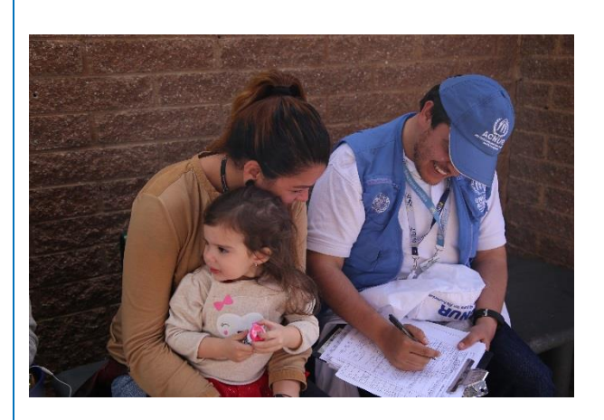
UNHCR staff supporting the registration of Venezuelans in Soacha, near Bogotá, June 2018.