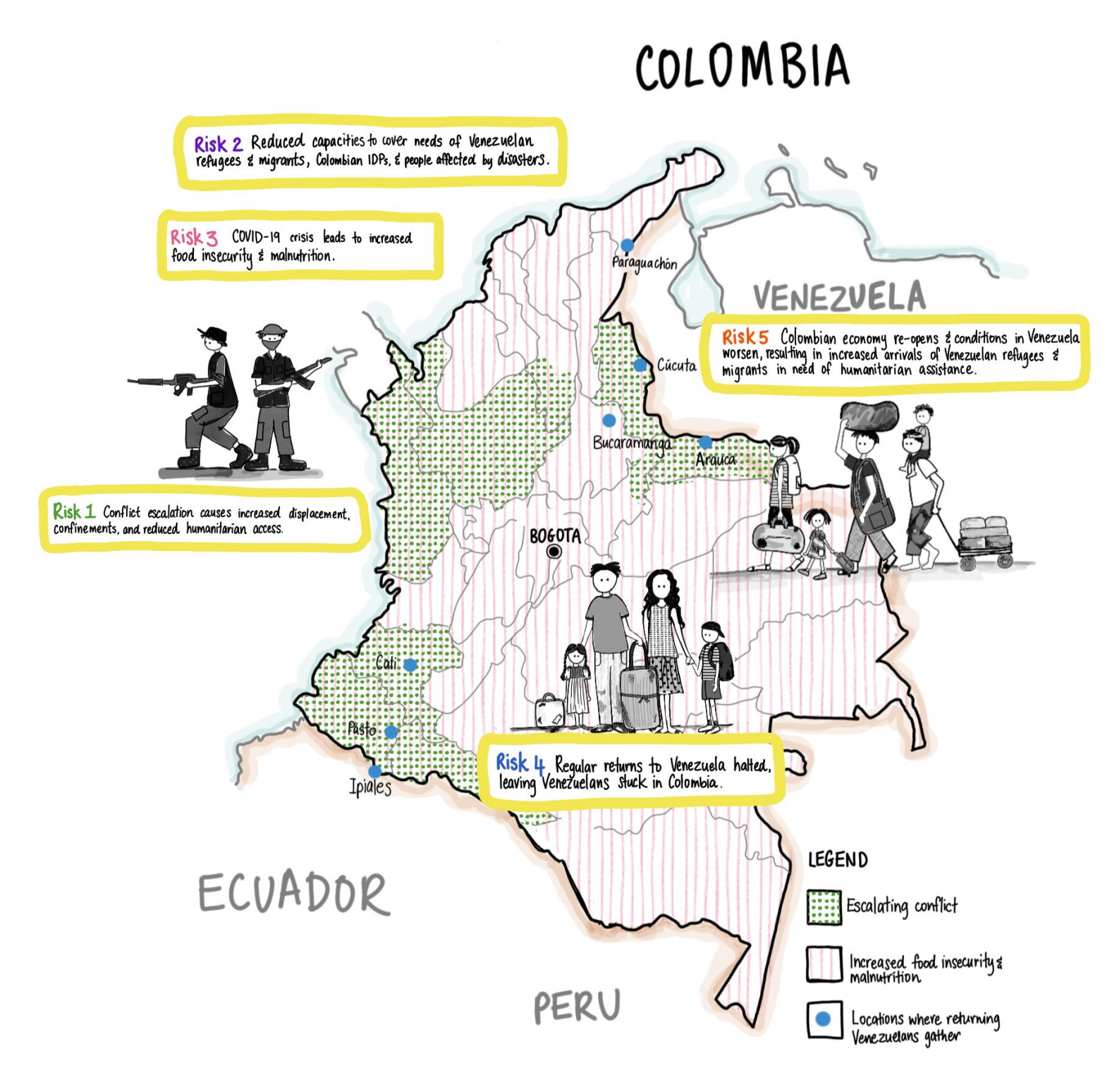
Illustration by Sandie Walton-Ellery