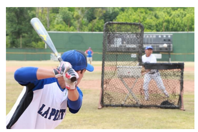
Representatives of migrant/refugee and host communities playing baseball in an integration through sports event in Buenos Aires, Argentina.

In Argentina, partners reached 156 individuals through workshops for skills' development, particularly on how to prepare a CV, design a job search strategy and carry out a job interview; and, on the sequence of service in restaurants, use of tray, etiquette and protocol. During the reporting period, 12 refugees and migrants from Venezuela were reached with support for accessing job opportunities in the formal sector in Paraguay through the referral and registration in a job board in which profiles are analyzed by the General Employment Directorate of the Ministry of Labour.