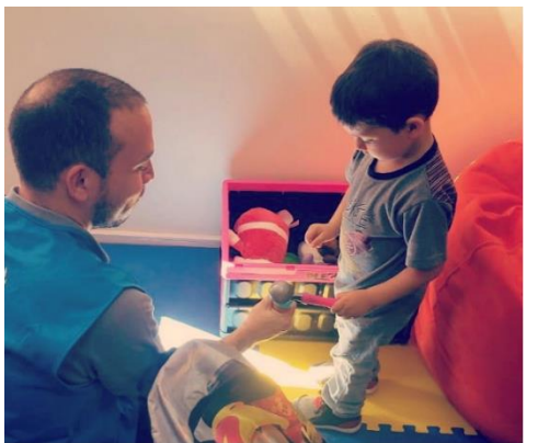
Newly opened child-friendly space/day-care centre by partners in Santiago.

Partners in Chile provided support, advice and guidance to refugees and migrants from Venezuela for regularizing their migratory status in the country.