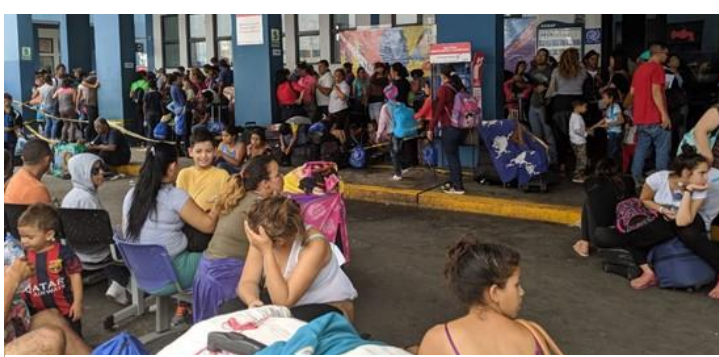
Figure 2 New arrivals at the CEBAF. Tumbes

The introduction of a new humanitarian visa to enter Peru on 15 June had a significant impact on the humanitarian response in the country. Arrival flows at the Binational Assistance Border Centre (CEBAF), at the northern border with Ecuador, rose from an average of 1,800 in May to 3,000 ahead of the introduction of the humanitarian visa, with a peak of more than 8,000 arrivals on 14 June. After a few days of further arrivals, numbers have since steadily declined and, in the last seven days of the month, the average is less than 400 per day.