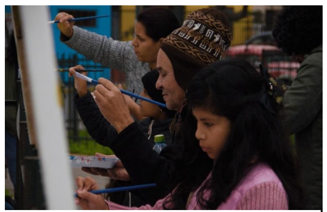
Figure 5 Peruvians and Venezuelans painting a mural in preparation for the publishing of the "Faces of the Venezuelan Migration in Lima" study.

In Lima, partners, together with the Lima Metropolitan Regional Office (DRELM), trained over 150 headmasters and teachers from more than 50 educational institutions, in intercultural issues, integration and psychological first aid.