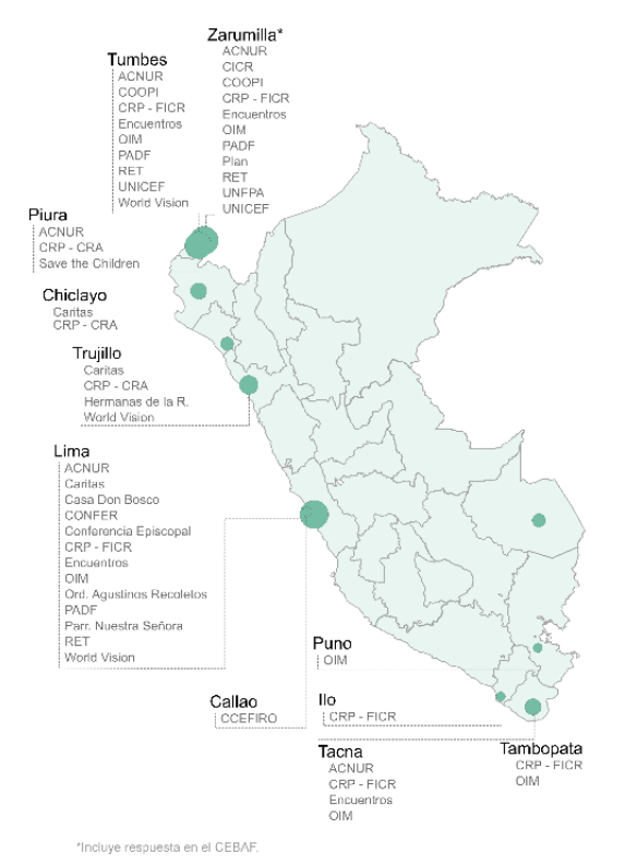
Figure 6 Operational presence for Area 1 in Peru (May 3W exercise).