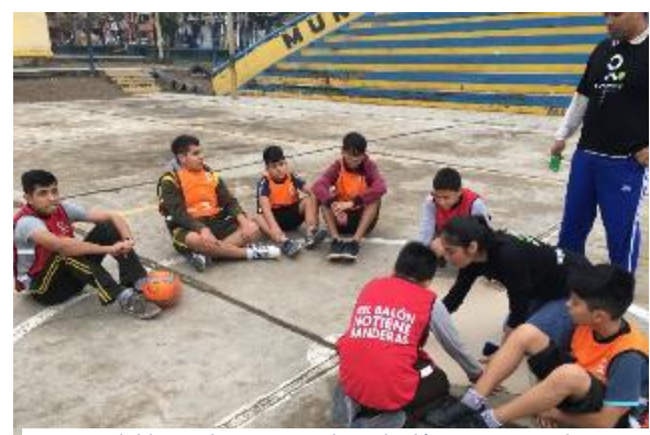
Figure 4 Children taking part in the #ElBalónNoTieneBanderas initiative

In the San Martín de Porres district of Lima, where one out of five inhabitants is Venezuelan, the "Oportunidades sin Fronteras" (Opportunities Without Borders) initiative is in progress. Its main goal is to promote social cohesion in all forms, but with special emphasis in the economic autonomy of Venezuelan refugees and migrants. In this district, a local diagnostic on labour demand and work profiles, to be finalized in October 2019, has been also initiated.