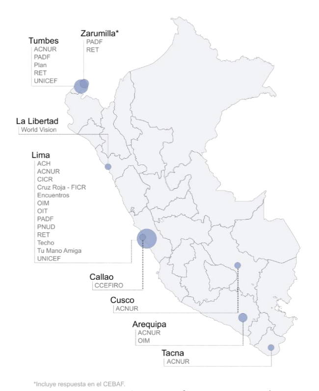
Figure 9 Operational presence for Area 3 in Peru (May 3W exercise).