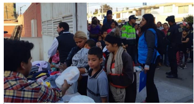
Figure 3 Distribution of baby formula and NFIs in Tacna.