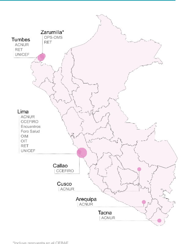
Figure 8 Operational presence for Area 4 in Peru (May 3W exercise).