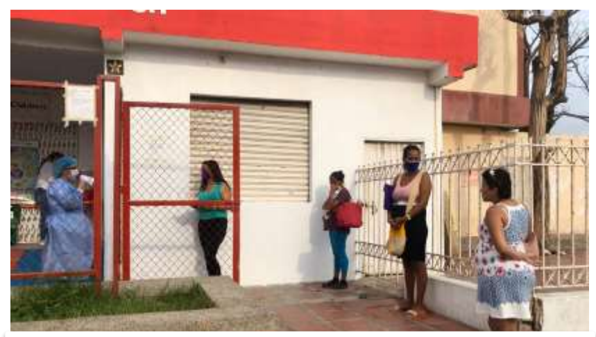
A trained health provider is informing the patients about the new measures. We believe that is important for them to know why are we adapting the response.

We ensure that in the pre-triage are we early recognize suspected patients using screening questionnaires. After that, immediate isolation of patients with suspected COVID-19 symptoms in a separate area is done.