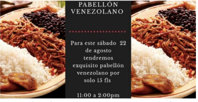
Advertisement of community business selling Venezuelan food

• With the objective of achieving socio-economic integration and enhancing social cohesion, integration activities resumed in Aruba, including the facilitation of three budget and marketing courses to 34 Venezuelans. Refugees and migrants learnt how to capitalise their own abilities and developed a marketing project and a sales pitch. They created a community business where six of them produce food products while the rest are in charge of the selling and distribution. Thanks to this initiative, they obtained the income to survive