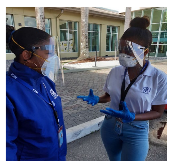
R4V partners in Trinidad & Tobago assisting persons in need in July

Dominican Republic, Curaçao and Trinidad and Tobago to help them fulfill basic needs.