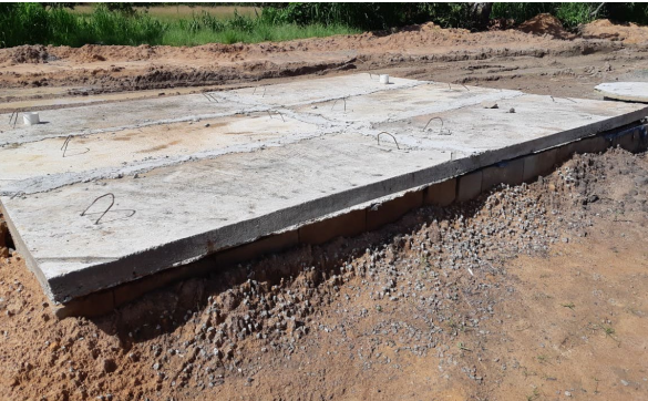
Fig 6. Tank connected to toilets