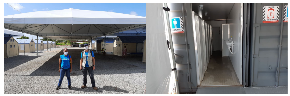
Fig 1. Site impression

Drinking water fountains : Present, but are out of order due to lack of cleaning filters