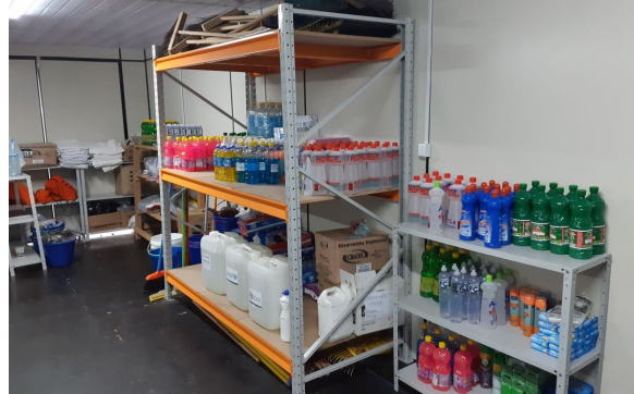
Fig 5. Cleaning equipment storage