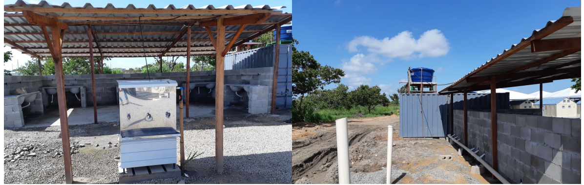
Fig 3. Water fountain